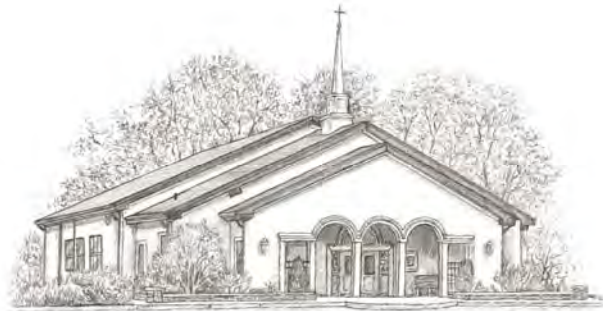
ST. ANTHONY CLARET